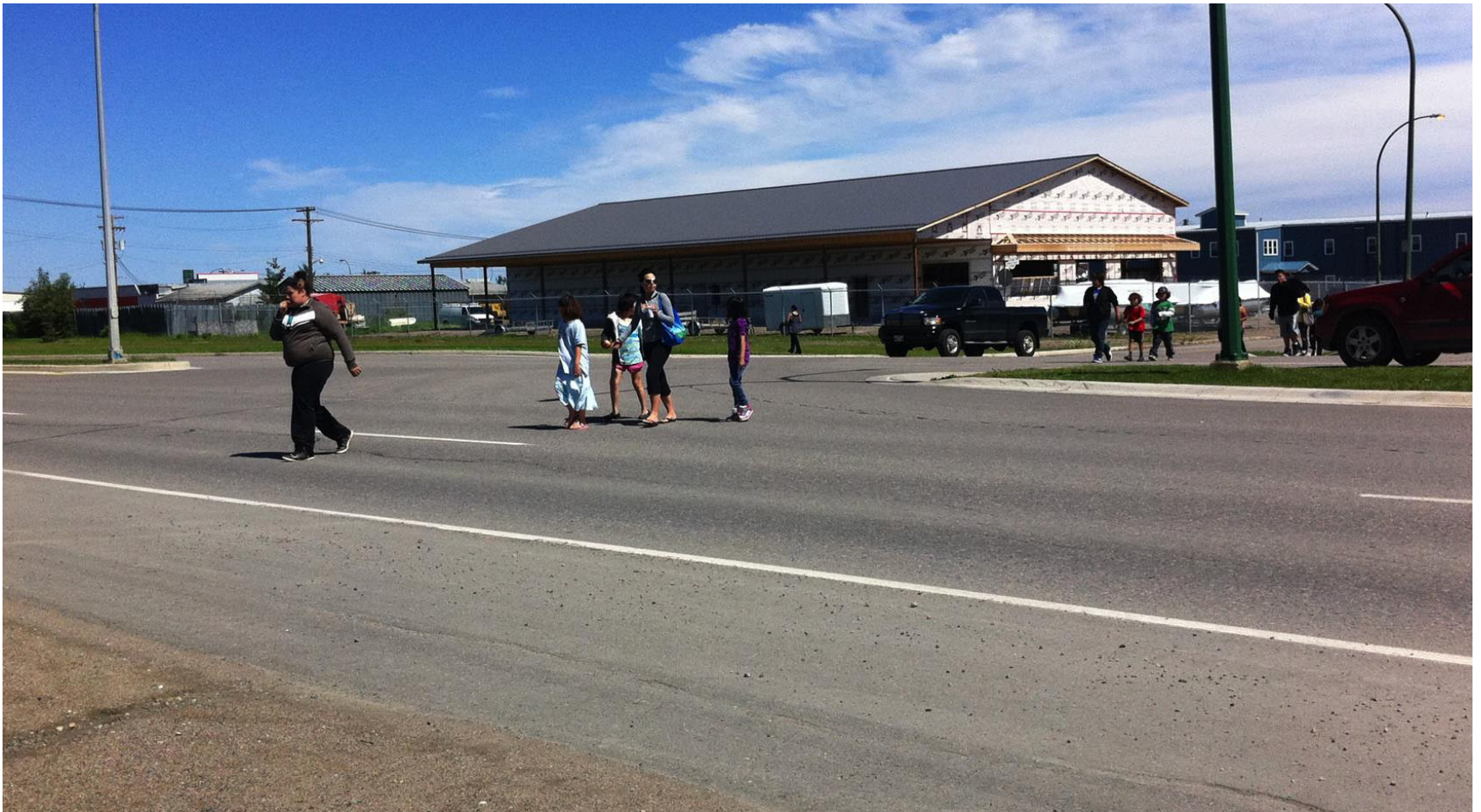
Ecole Riverside, School District of Mystery Lake