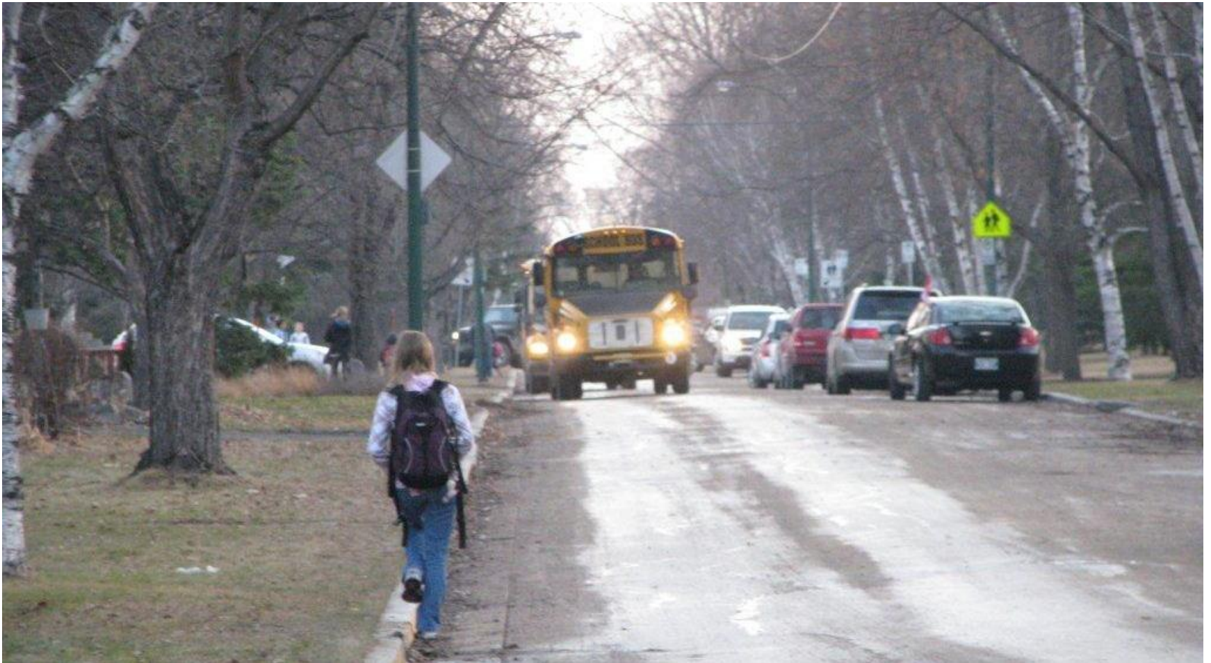
Ecole St. Avila, Pembina Trails School Division